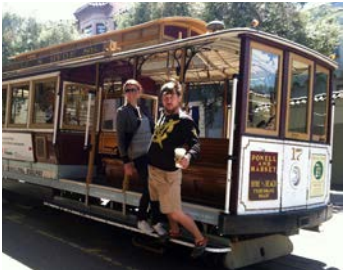
Street car in San Francisco

and a survival trip in the Adirondacks. He learned fly fishing and brought home 40 lbs of Salmon, Halibut, and Cod. Together they went to L.A., San Diego, San Francisco, Sacramento, Berkeley, Las Vegas, and Detroit Lakes, MN, this summer. In October they took a trip to Maine where they camped out on the beach.