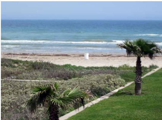
South Padre Island