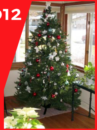
Our tree in White Bear Lake