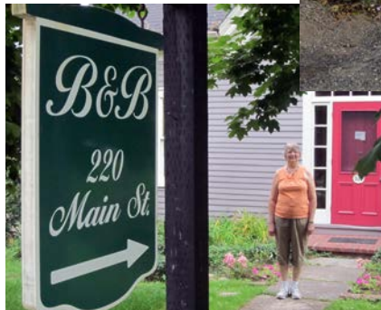
Bed and Breakfast in Wolfville, Nova Scotia