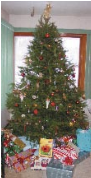
Our Christmas tree last year