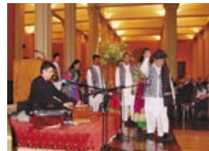
Afghanistan Fundraiser at the Landmark Center