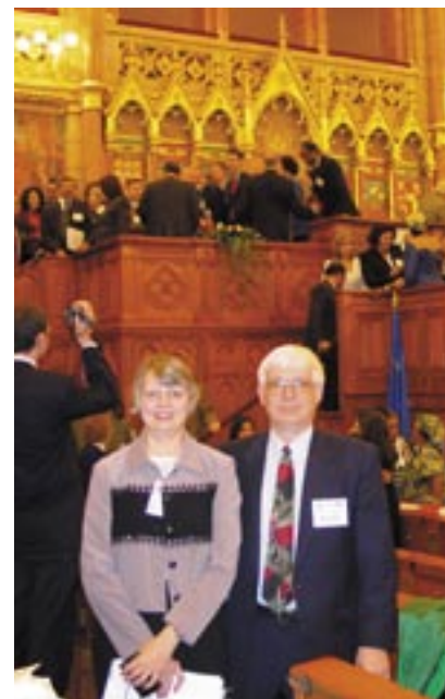
At the Parliament in Budapest