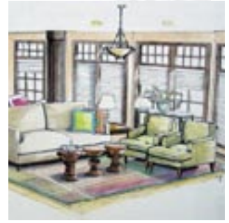
One of Tami's Design Sketches