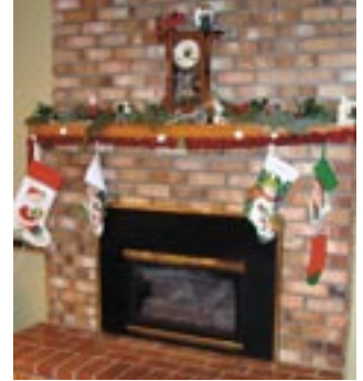
Our Fireplace ready for Santa